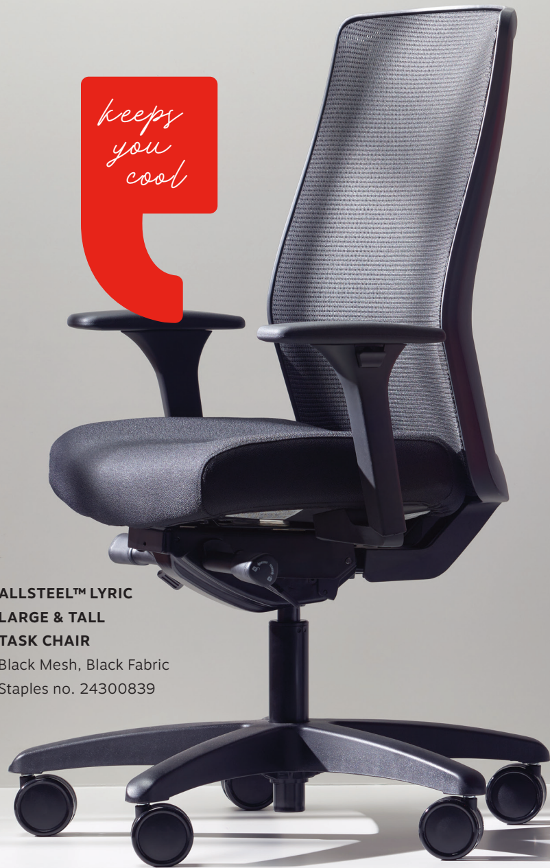
ALLSTEEL™ LYRIC LARGE & TALL TASK CHAIR Black Mesh, Black Fabric Staples no. 24300839

Comfort and productivity go hand in hand, so let's make a few smart ergonomic swaps. It can make a big difference to your team's well-being, wherever they're working.