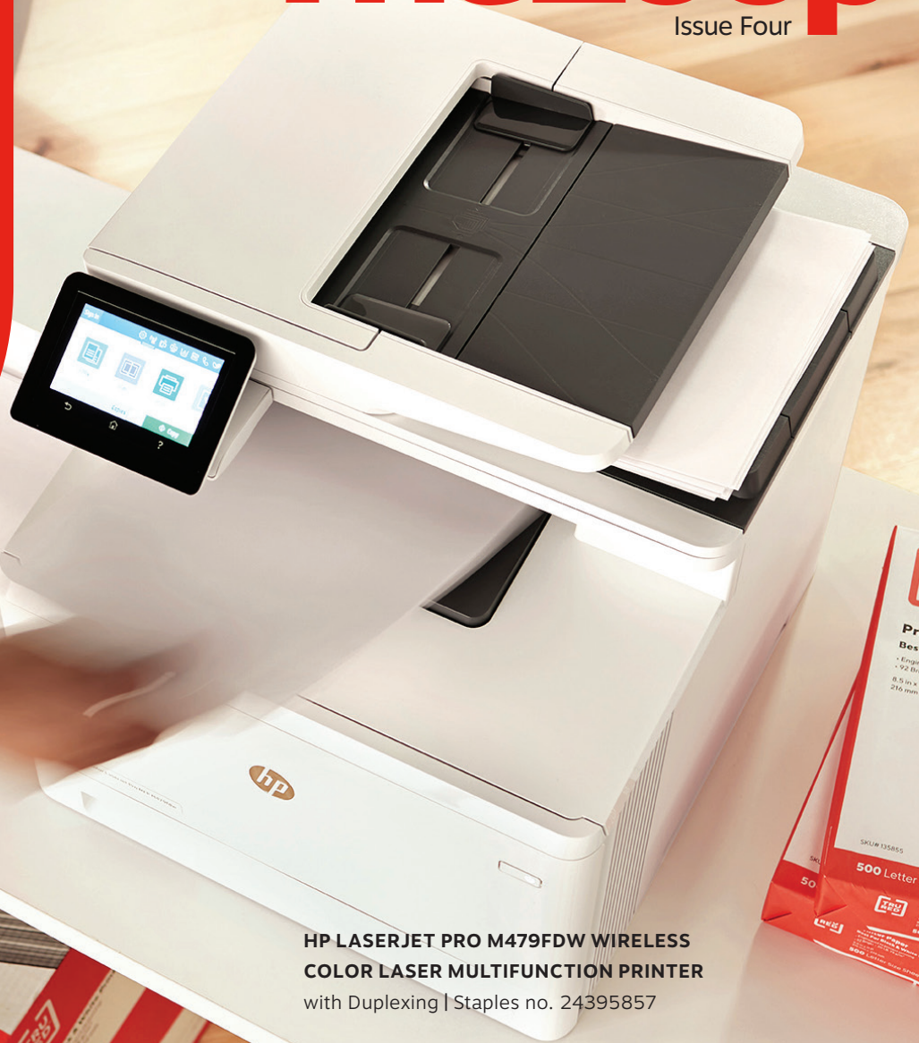
HP LASERJET PRO M479FDW WIRELESS COLOR LASER MULTIFUNCTION PRINTER with Duplexing | Staples no. 24395857