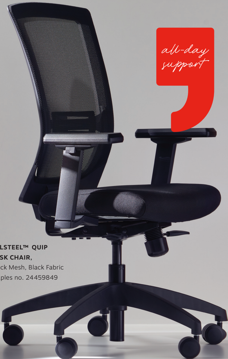
ALLSTEEL™ QUIP TASK CHAIR, Black Mesh, Black Fabric Staples no. 24459849