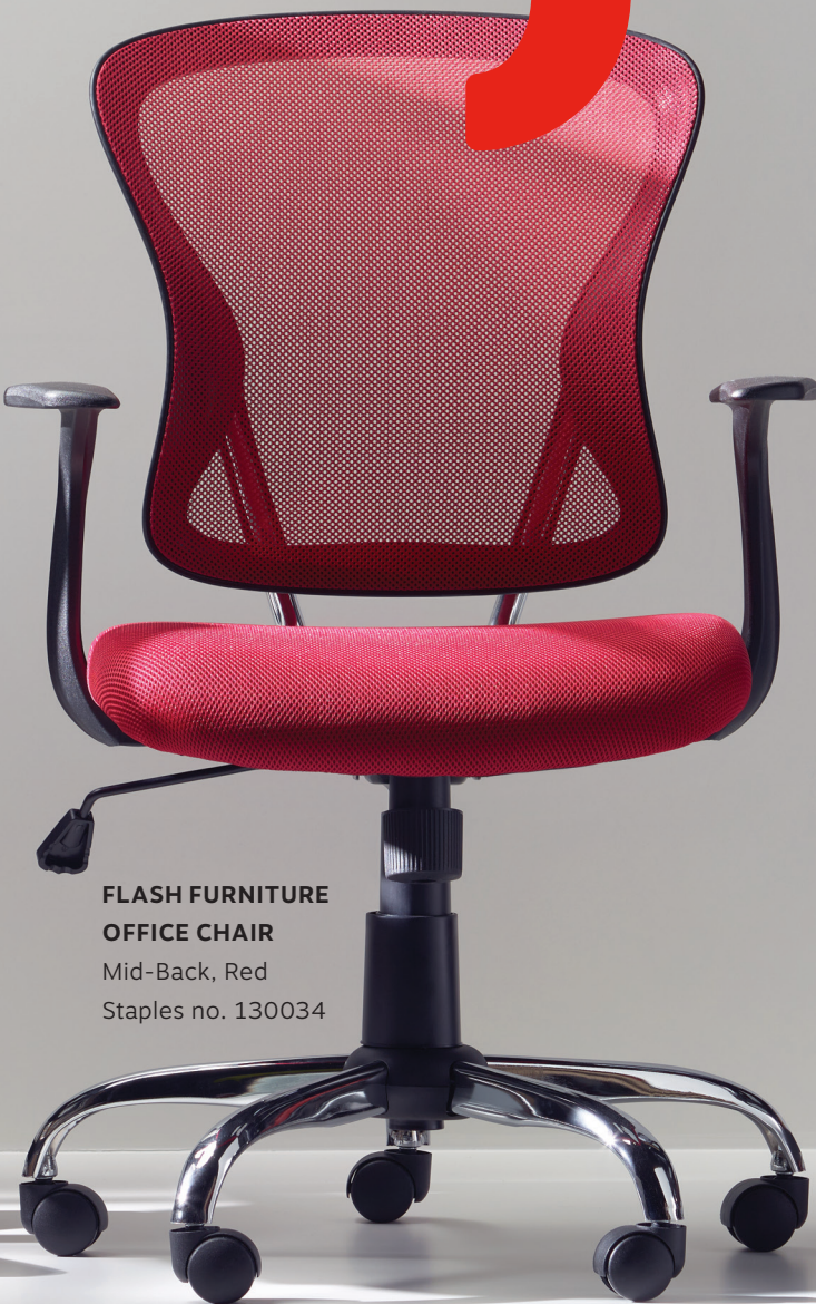
FLASH FURNITURE OFFICE CHAIR Mid-Back, Red Staples no. 130034